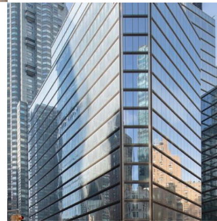
OFFICE REPOSITION NEW YORK 69,677 sqm