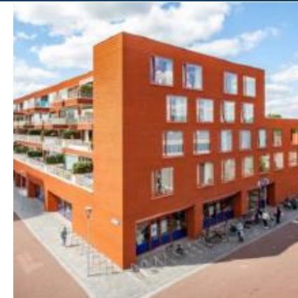
HOTEL DEVELOPMENT BOSTON $220m GDV