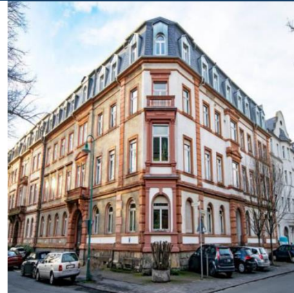
RESIDENTIAL DEVELOPMENT LONDON 200 units