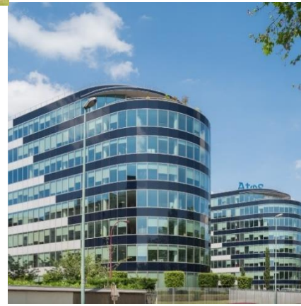
OFFICE CAMPUS PARIS 64,000 sqm