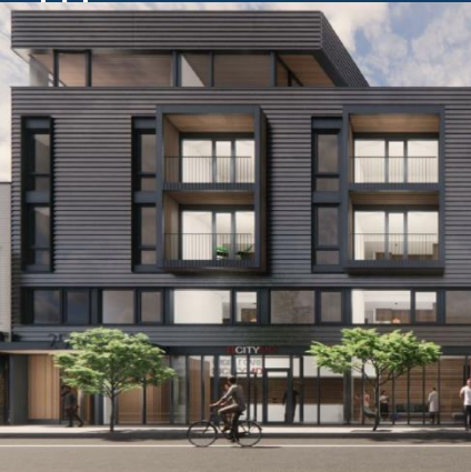
RESIDENTIAL DEVELOPMENT NEW YORK $25m GDV