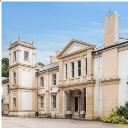
HISTORICAL RESIDENTIAL ESTATE UK £85m GDV