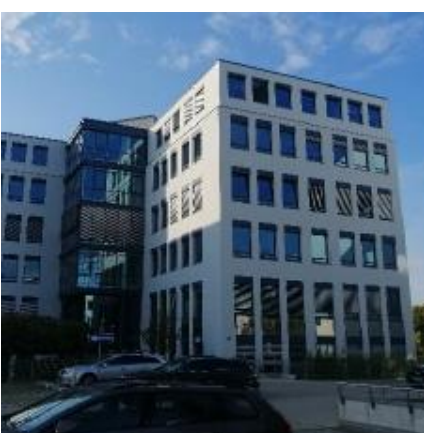
RESIDENTIAL PORTFOLIO GERMANY 5000 units