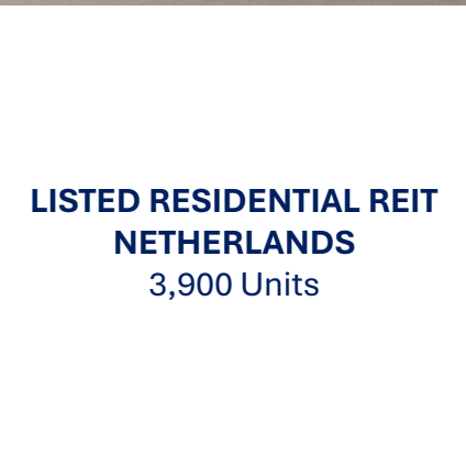
LISTED RESIDENTIAL REIT NETHERLANDS 3,900 Units